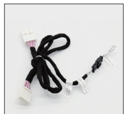
Control bypass cable