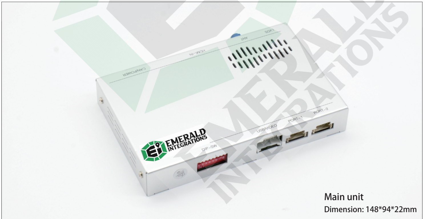
Main unit Dimension: 148*94*22mm