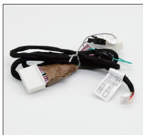
Screen bypass cable