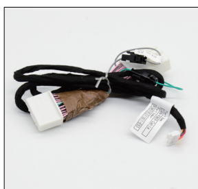
Screen bypass cable